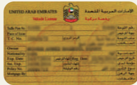
Vehicle Registration Card Back