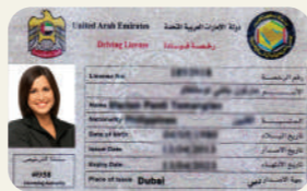
Driving License Back